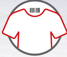
Shirts loaded on Digital Line