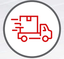
Delivered to your customer

Inline heat press with adjustable pressure and time per garment thickness