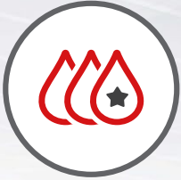
Shirts printed on GTX600