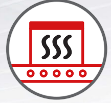
Cured and pressed

Inline Pretreat with 3 spray width and dual pretreat fluids