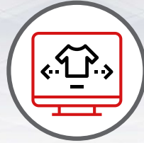
Shirt returns to operator