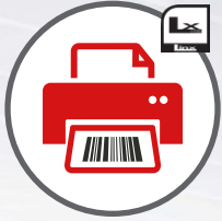
Orders and Barcodes Created