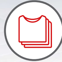
Packaged and barcode scanned for shipping