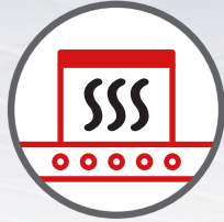
Printed ink cured by Firefly